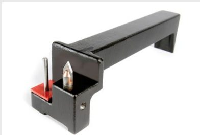
NAGEL drill bit sharpener for quick on-site resharpening